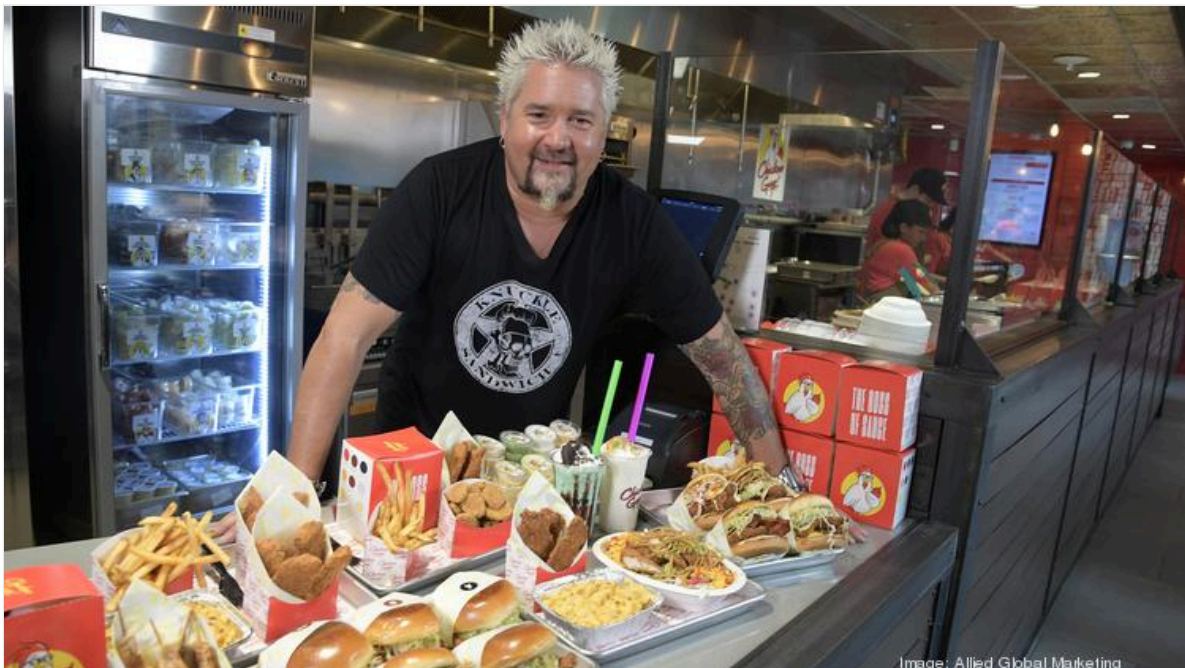
Celebrity Chef Guy Fieri also has a location of his fast-casual chicken eatery Chicken Guy! in Harrah's Resort Atlantic City.

Park Place Prime will be owned and operated by Bally's.